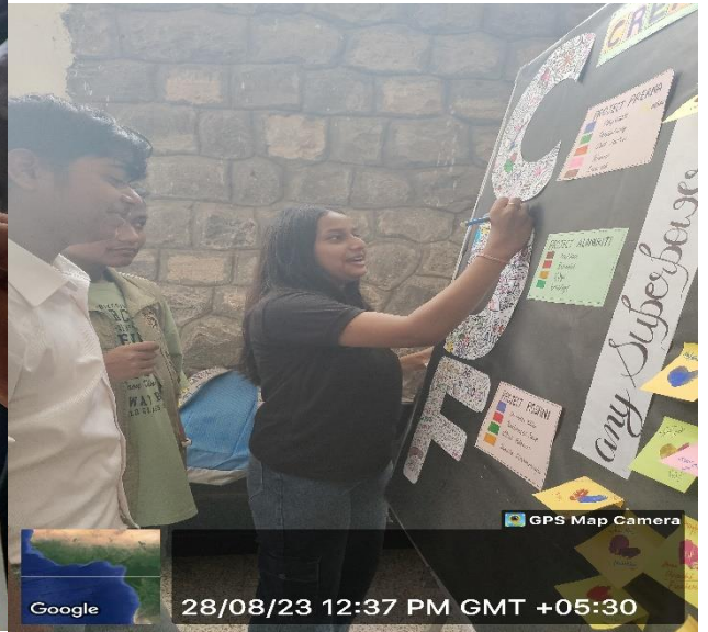
GPS Map Camera Google 28/08/23 12:37 PM GMT +05:30