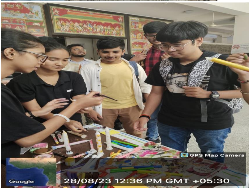
GPS Map Camera Google 28/08/23 12:36 PM GMT +05:30