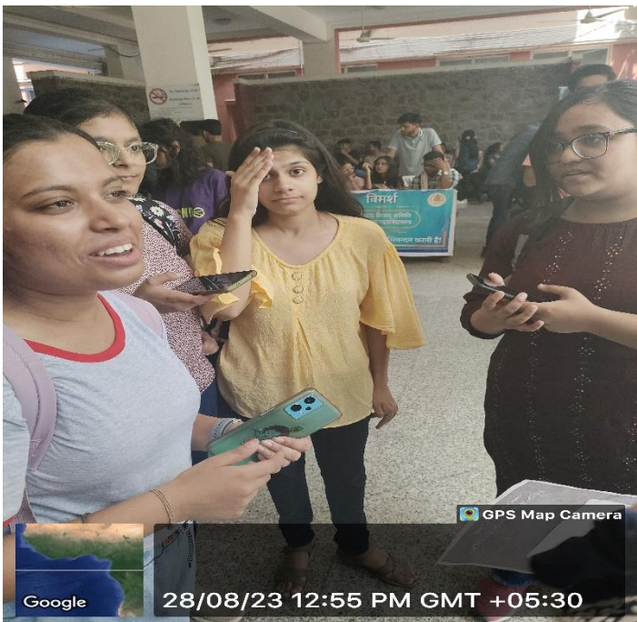
GPS Map Camera Google 28/08/23 12:55 PM GMT +05:30