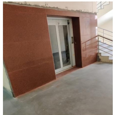
Lift in New Academic Block