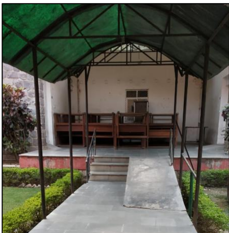
Entry to the Classroom