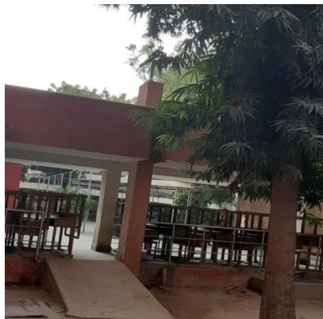
Entry to the Photocopy Facility