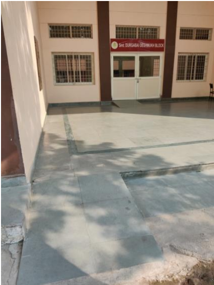
Entry to the New Academic Science Block