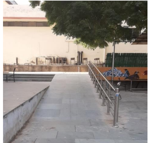
Ramp connecting the Canteen and new Academic Science Block