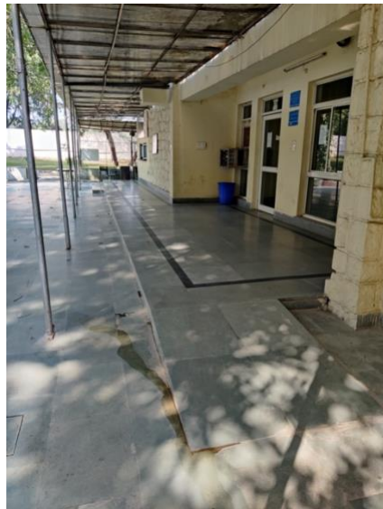
Entry to the Canteen