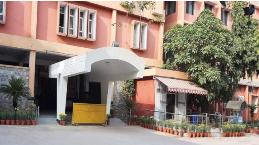
Entry to the College Building