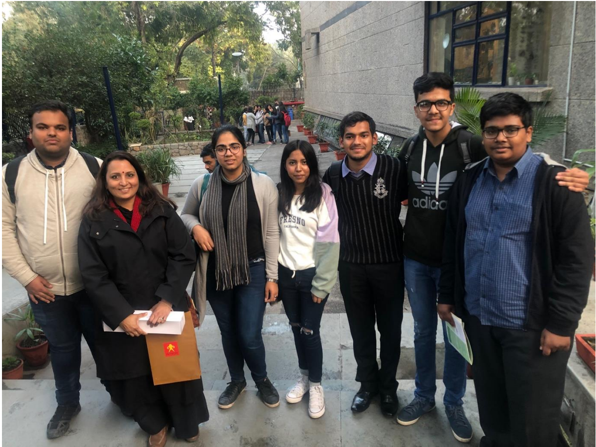
Figure 1 students after the session