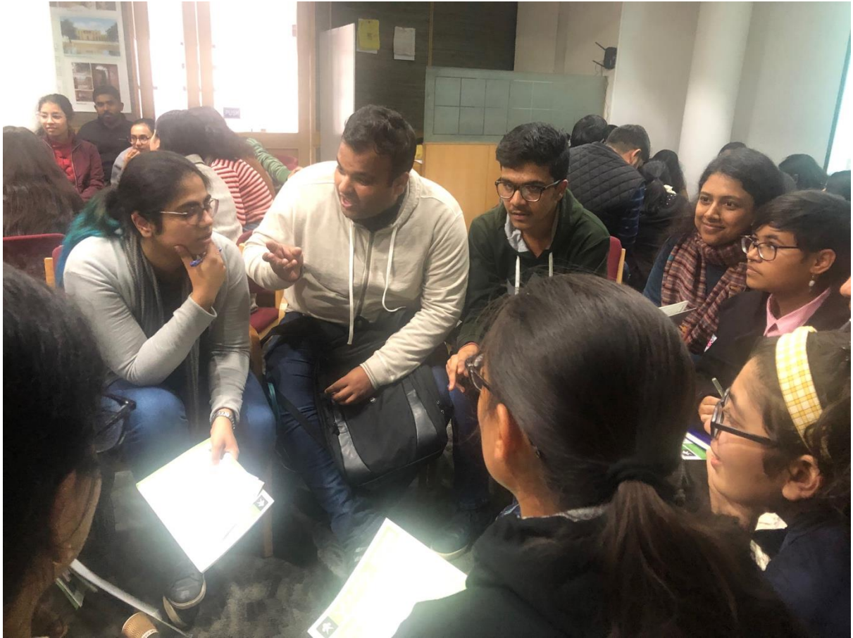
Figure 3 Discussions going on