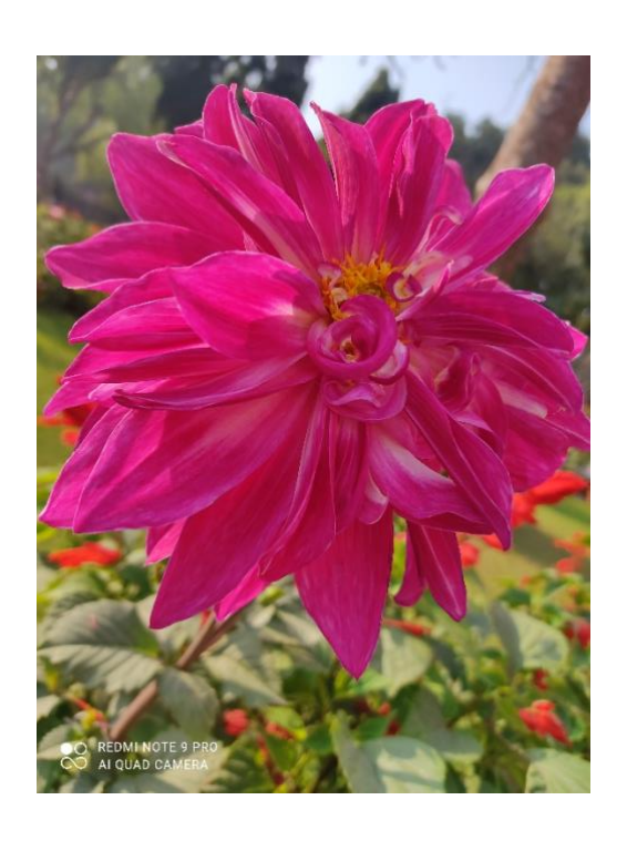
2<sup>nd</sup> price Ekta English Hons 2<sup>nd</sup> year