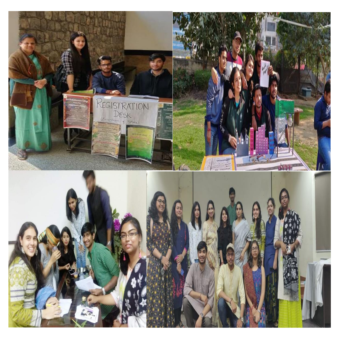
Glimpses of SCI-FUN 2019